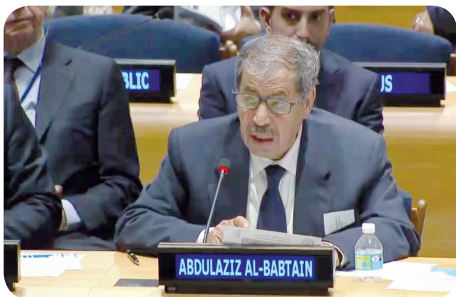
Giving his speech at the second session of the High-Level Forum