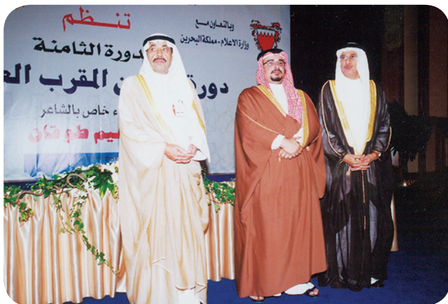
Abdulaziz Albabtain with HH Sheikh Salman Bin-Hamad, Crown Prince of Bahrain and Mr. Nabil Bin-Yaakoub Al-Hamar, Minister of Information, Manama 2002.