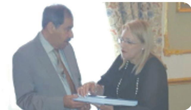
His meeting with the President of the Republic of Malta Marie-Louise Coleiro Preca at the Presidential Palace on July 1, 2018 to invite her Excellency to the World Forum for the Culture of Peace.