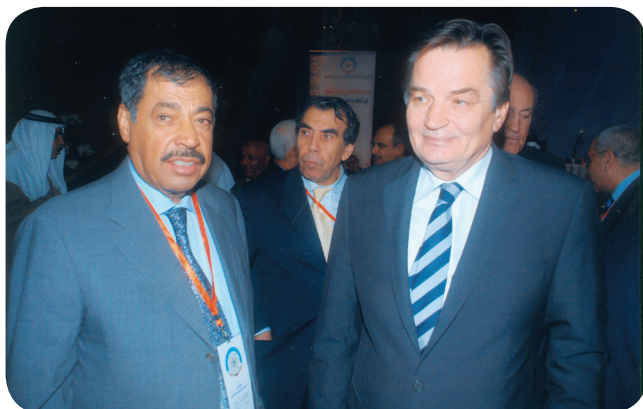
With Former Bosnian President Haris Silajdzic, Sarajevo 2010.