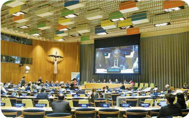
The UN General Assembly High-Level Forum on the Culture of Peace