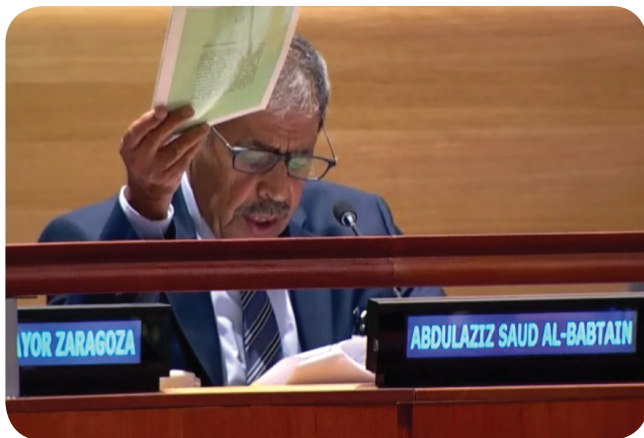
Abdulaziz Saud Albabtain during his speech at the General Assembly of the United Nations, presenting the model manual prepared by the Foundation for the education of Culture of Peace at all levels of education around the world. (September 5, 2018)