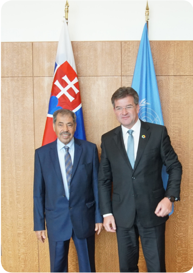
Abdulaziz Saud Albabtain with Miroslav Lajčák, President of the United Nations General Assembly at his office. (September 5, 2018)