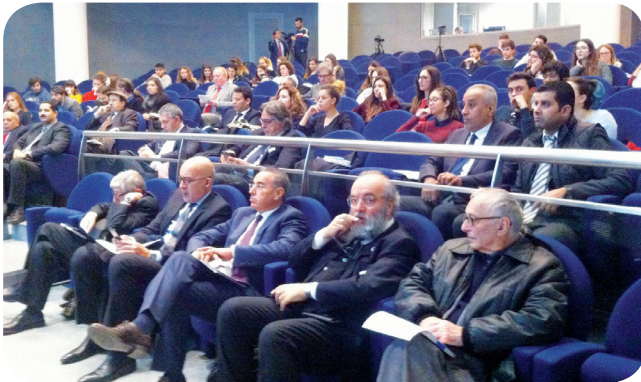
The audience at the opening ceremony of Abdulaziz Saud Albabtain Chair for Peace in Europe held on 22 November 2017 at the Great Hall of Roma Tre University.