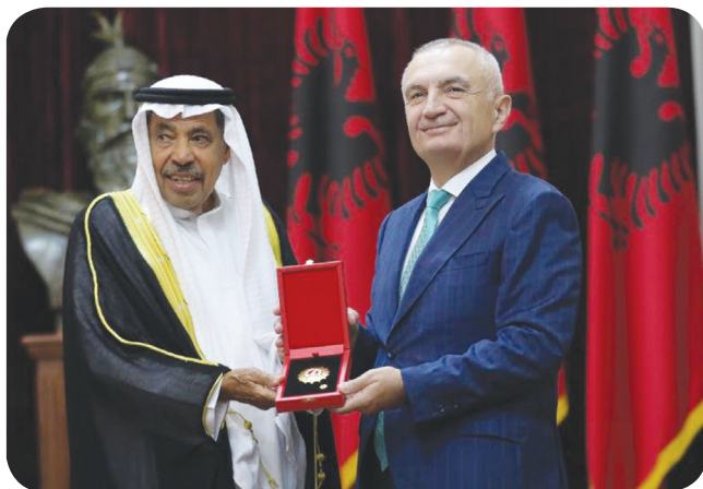
receives the Albanian “Order of the Flag” from his excellency Ilir Meta, President of the Republic of Albania, in appreciation of his efforts in spreading the Culture of Just Peace, June 30 th , 2022.