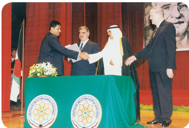
Abdulaziz Albabtain with HE late Prime Minister Rafik Al-Hariri and Fawzi Hobeiche, Minister of Culture (right), Beirut 1998.